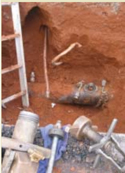
Aggressive water can attack metallic plumbing materials other than copper. Exceedances of the EPA's lead action limit can force utilities to replace existing lead pipe. This photo shows a pit dug to partly replace an existing publicly owned lead pipe with a copper pipe.

of drinking water in the District of Columbia, received a report in July 2001 from the District of Columbia Water and Sewer Authority (WASA) showing elevated concentrations of lead in water samples taken from residences in the WASA service area. A subsequent report, for the period July 1, 2001, to June 30, 2002, revealed that lead levels exceeded the action level in 26 of the 53 samples taken for that monitoring period. A test conducted in the summer of 2003 revealed that two-thirds of 6,188 District homes had